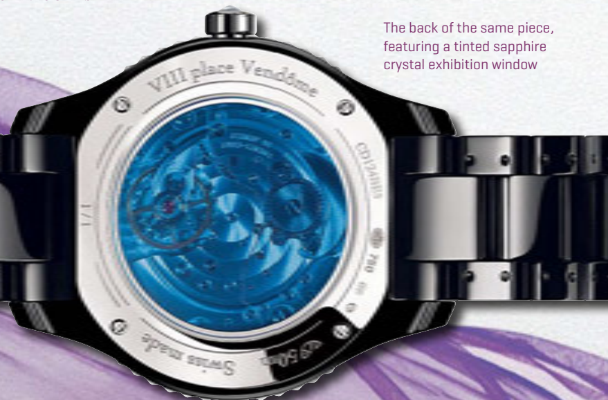
The back of the same piece, featuring a tinted sapphire crystal exhibition window