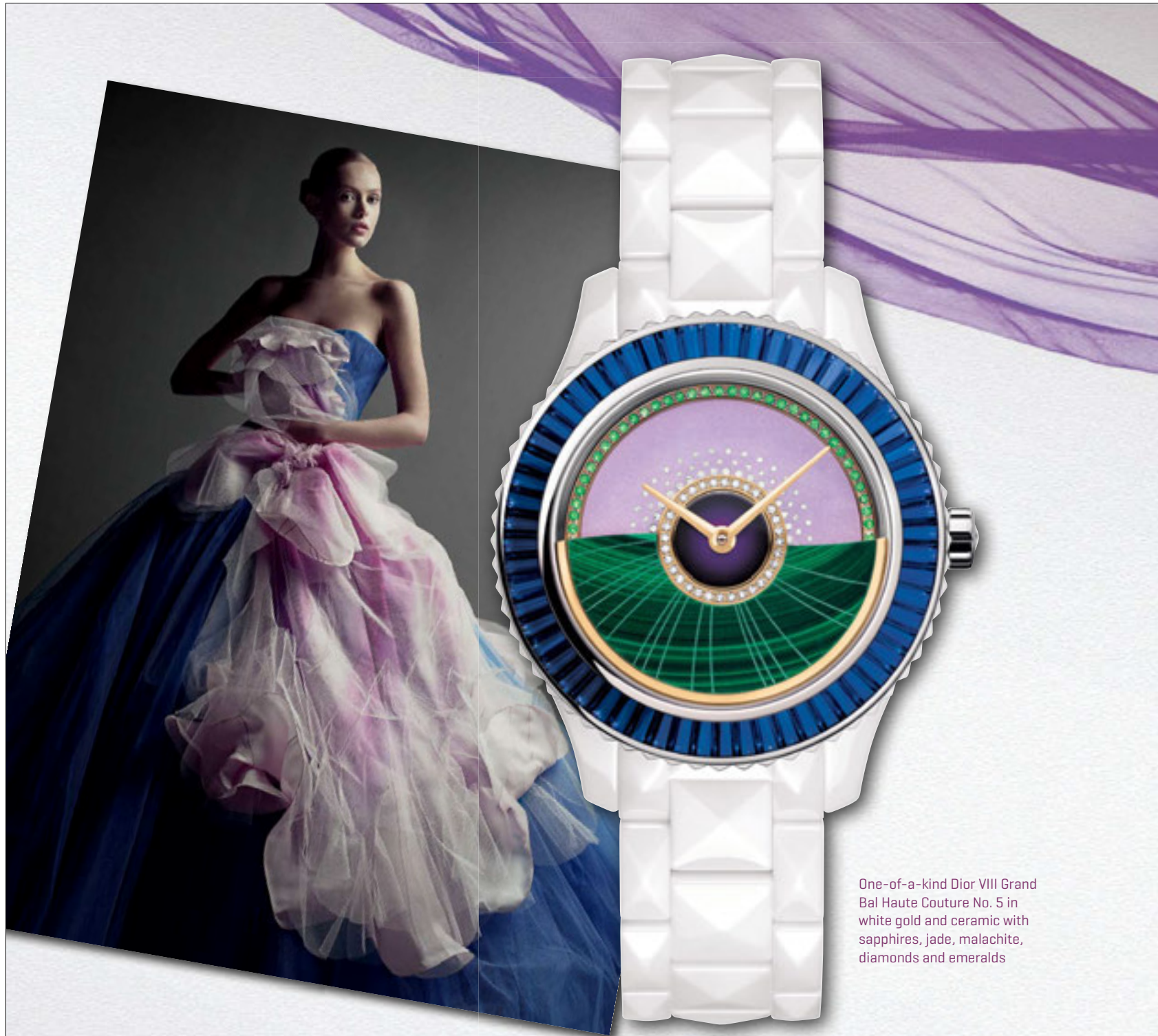
One-of-a-kind Dior VIII Grand Bal Haute Couture No. 5 in white gold and ceramic with sapphires, jade, malachite, diamonds and emeralds

For example, the first in the series mixes the collection's slick high-tech black ceramic case and bracelet with a luminous Australian opal dial, a bezel set with baguette-cut tsavorite garnets and an oscillating weight made of mother-of-pearl marquetry. The Model No. 5 offers a colorful variation on the theme with a jade dial set with diamonds and emeralds and a rotor fashioned from engraved malachite. "The lapidary work is unusual, because we ask the craftsmen to engrave materials, set stones on other stones, or create a very refined marquetry," explains Nicolas. "All these steps require extreme precision, particularly when they have to cut a very