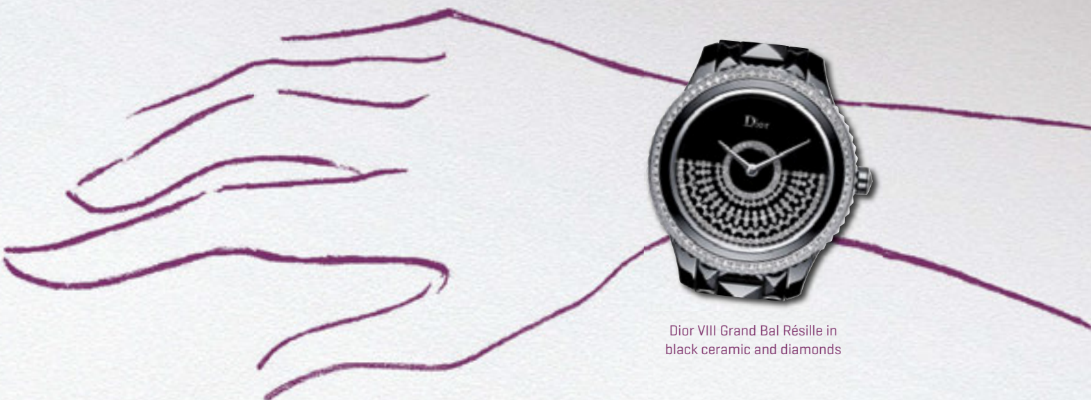
Dior VIII Grand Bal Résille in black ceramic and diamonds