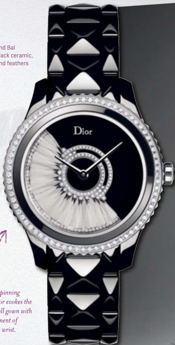
The visible spinning winding rotor evokes the swirl of a ball gown with every movement of the wearer's wrist.

Unlike many fashion watch brands that emphasize style over substance, Dior was among the pioneers that ambitiously sought to combine the two. Dior's Grand Bal VIII range, introduced in 2011, is the latest, and perhaps most expressive, endeavor to harmonize the creativity of haute couture with the technical demands of haute horlogerie .